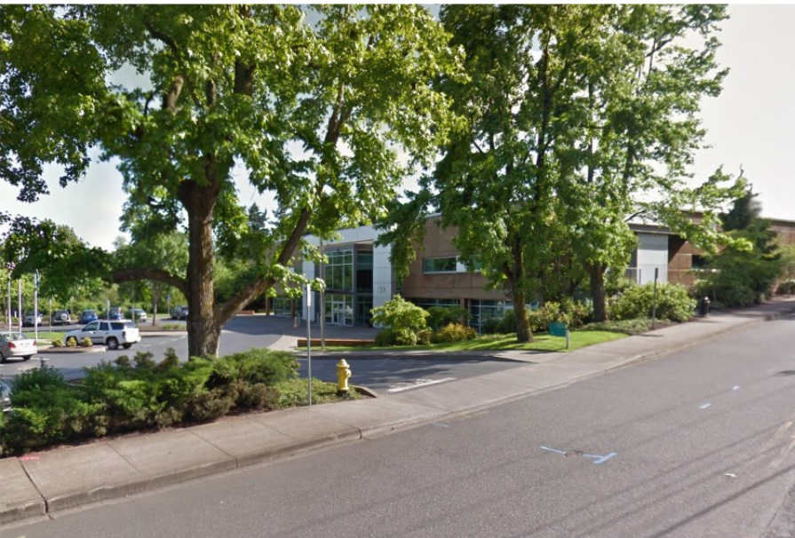
Pictured above is our Milwaukie, OR location. Our new address is 10505 SE 17th Ave. Milwaukie, OR 97222.

As always, we appreciate your business and look forward to assisting you soon.